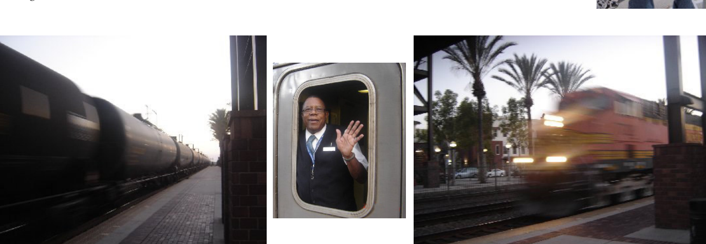
HOT RAIL! NEWSLETTER