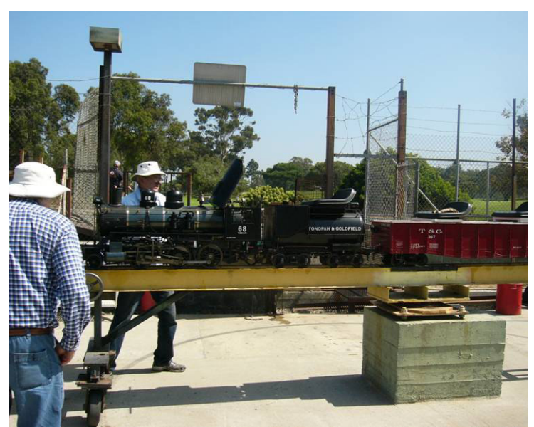
After the water pump bearing failure "Emma" was eased back to the turntable...