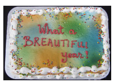
VOL. VIII NO. 3 - FALL 2010