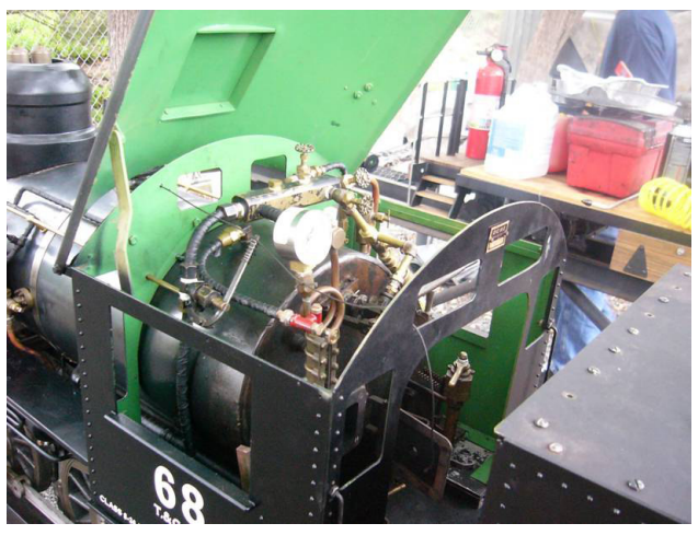
The cab sports a new reflex water glass