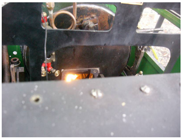
The fire roars in the firebox with compressed air for draft; when the boiler pressure reached 30psi he switched to steam for draft