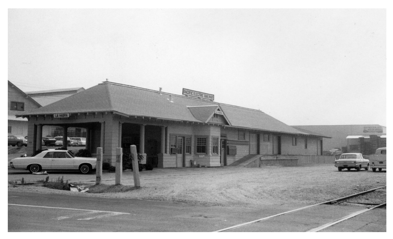
Above, La Habra PE Depot; below, La Habra UP Depot. Photos taken in 1965, after UP abandoned their track and depot and after PE became Southern Pacific.