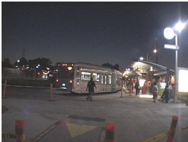
Orange Line station stop at night.

Charles' memories of "The Train That Did Not Go Down Manning Avenue" were recently published in the December 2005 issue of Trains Magazine.