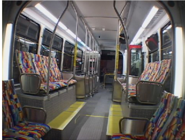
Orange Line car interior.

It seems foolish to me now, not to have rebuilt the remaining few miles which leads to the mainline, a few minutes from the Canoga Park Amtrak-Metrolink station! One could not go all the way up onto the mainline, but widen a few surface streets starting with the wimpy two-lane road next to the location the branch line used to connect with the main, to accommodate the elongated beasts, so that they can