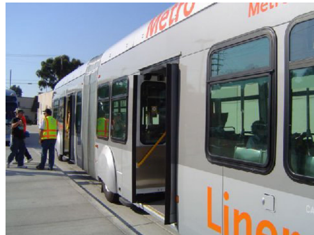
Boarding the new Orange Line.

Boarding went very quickly, as these odd new buses were boarded at the front and middle of the elongated cars at the same time, ours filling up with hushed passengers.