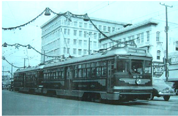
Photo displayed in Pacific Electric's No. Hollywood Station showing old P.E. car at stop.

More interesting than a glimpse of the museum is the monorail tram-train that takes visitors up to the Museum complex from a parking lot. Elliott and I had seen it heading up the hill as we went in the opposite direction