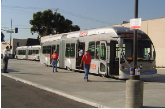
Orange Line at stop.

During lunch, I discovered I had not set my watch back an hour due to the end of Daylight Savings time, thereby gaining an hour, reminding me of the plot in Jules Verne's Around the World in 80 Days . But then we lost a half hour waiting for the buses to arrive.