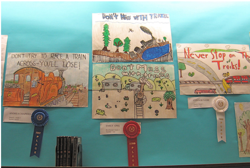
SCRPA Rail Safety Posters on exhibit during May at Fullerton Main Library's Children's Room.