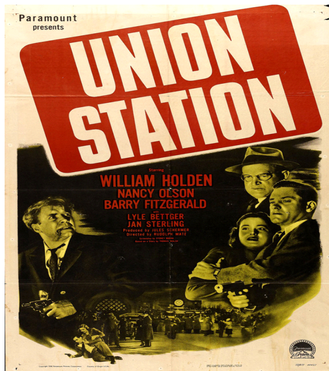
Original movie poster

as "Criss Cross," "Cry Danger" and "The Narrow Margin," as well as in newer films ranging from "Bugsy" to "Blade Runner." However the station's arguably biggest moment came in 1950, as the featured location in the Paramount Pictures 81-minute film "Union Station."