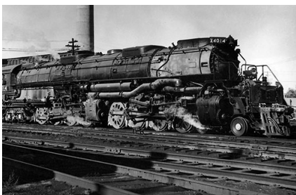
Union Pacific No. 4014 at Cheyenne circa 1958

In exchange for gifting of the locomotive to Union Pacific, the railroad promised Big Boy 4014 will "travel throughout the Union Pacific system for many years following its restoration and will be seen by millions of people."