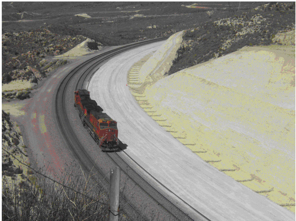
A brace of helpers return to San Bernardino through the freshly widened cut at the west end of Summit

These photos are in full color on the web!