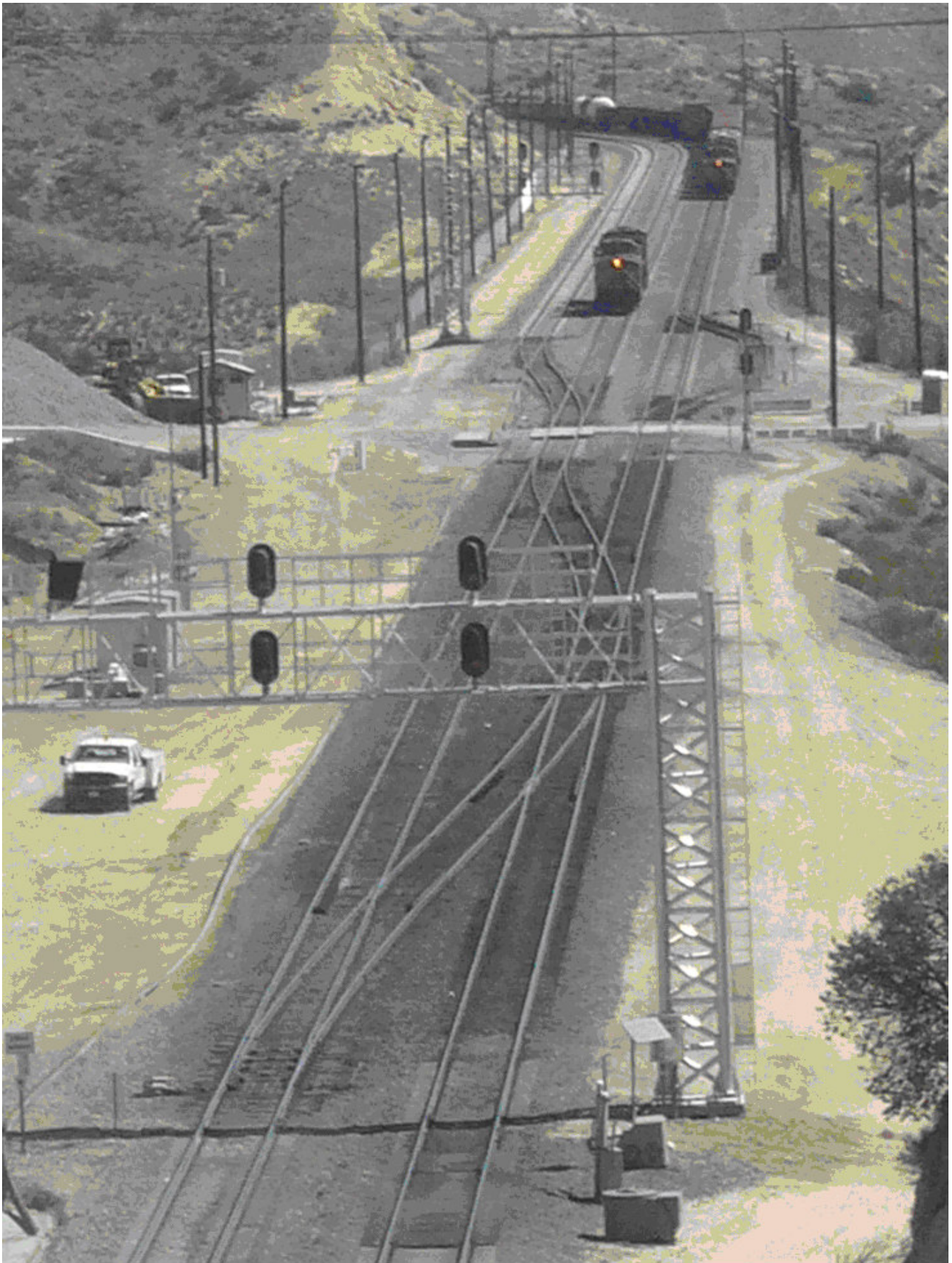
The west end of Martinez siding is visible in this shot looking east at Summit, CA. The new track will connect to the Martinez siding just beyond the grade crossing.