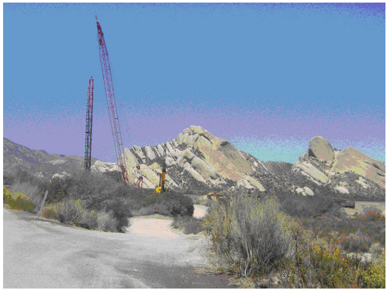
A pile driver works the west end of the new right-of-way near Mormon Rocks

It seemed that with the print media quoting BNSF, television news coverage of the activity up in the pass, and the chatter of local railfans, it was obvious that a trip