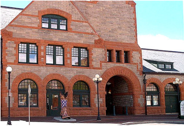
Street-side photo of prototype Cheyenne station in spring of 2007.

stopped short. After inspecting the model of Fullerton Depot, studying the many historic photos, and talking to the Historical and Modeling Committee members, he quickly joined FRPA and started attending Historical and Modeling Committee meetings.