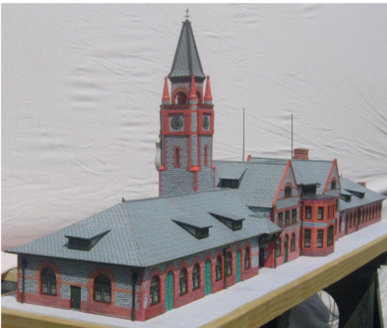
Track-side of Cheyenne Depot.

Forty-four H&MC and SCSRA brethren broke bread at their combined Annual Dinner/Dinner at the Depot on Saturday, July 28, held beside the SCSRA's two cabooses and the Coast Rail Services caboose, trackside at Fullerton Metrolink