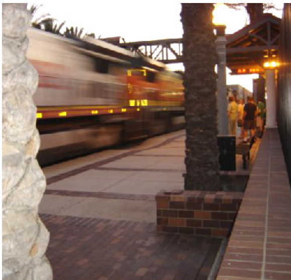
Train watching at Fullerton.

Fullerton Railway Plaza Association P.O. Box 5195 Fullerton, CA 92838-5195