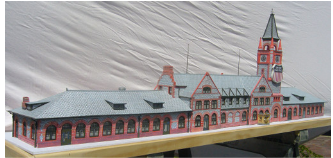
Street-side of model Union Pacific Cheyenne Depot backdated to reflect the station as it was in 1947.

For most of us, building a plastic model kit was a natural part of growing up. However, building an accurate scale model of a building, car, ship, or train is a skill that few of us ever really mastered. Luckily, for the Fullerton Railway Plaza Association, we have several talented model builders on board who can turn pieces of wood, paper, brass, and plastic sheet into accurate representations of buildings that are gone forever and now only exist in our memories.