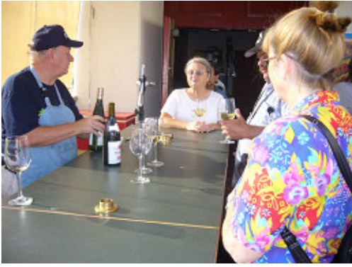
H&MC and SCSRA folks provide entertainment at FRPA's quarterly movie nights. A popular feature is the complementary wine tasting, sponsored by individuals and organizations within the FRPA family.

and other "behind the scenes" areas of the old building. The old Southern Pacific Depot still stands and is in use as offices for the Union Pacific, but not much else remains. The Roundhouse and engine fa-