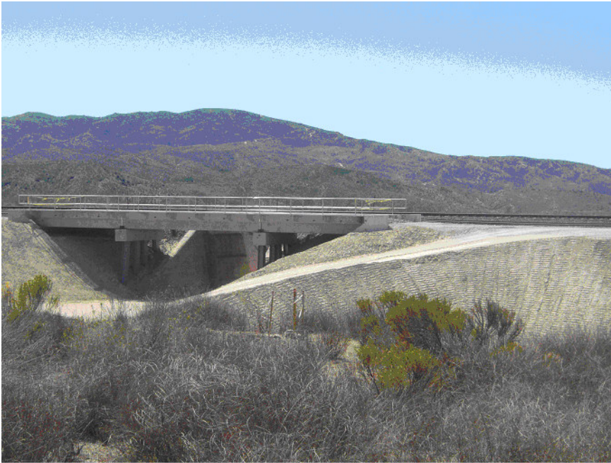
New right-of-way is complete and ready for track as it crosses Powerline Road near Little Knoll

not yet begun in this area, but pilings are being driven at the south end of the curve near the 1972 realignment.